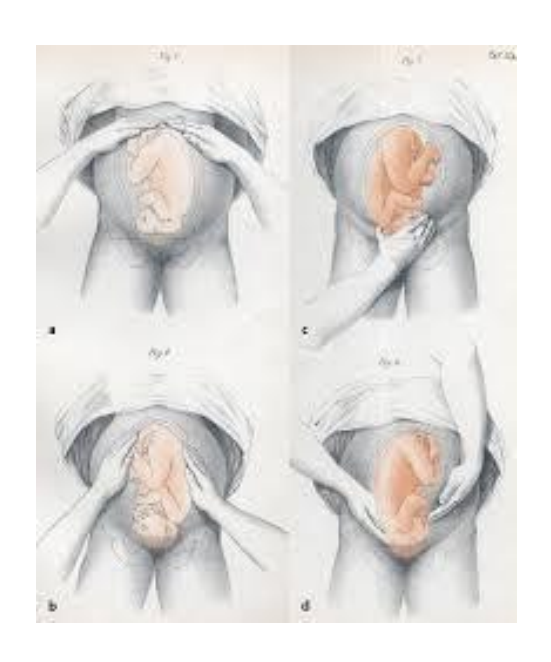
Figure 1. Leopold's manoeuvres

(https://en.wikipedia.org/wiki/Leopold%27s_maneuvers)